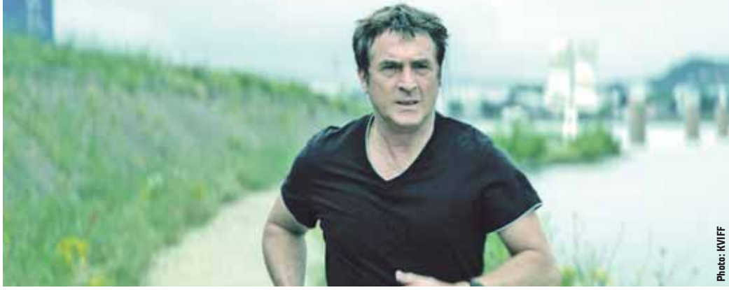
Philippe Godeau's 11.6 explores the motives of real-life criminal-cum-folk hero Toni Musulin.