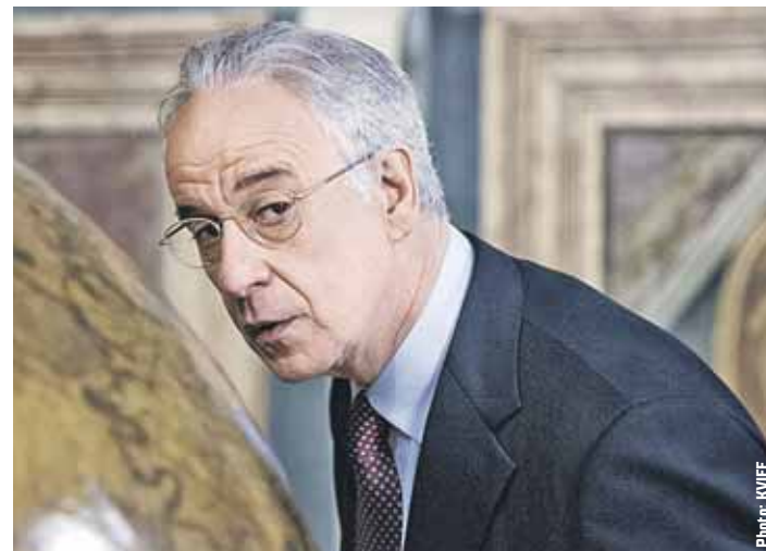
Toni Servillo rises to the challenge of playing dual roles.

"We're in the middle of an epochal crisis that has struck the criteria around which the West has been functioning, a crisis that hits the role of economics and politics, and we're all convinced that we've arrived at the point of no return, that it's necessary to