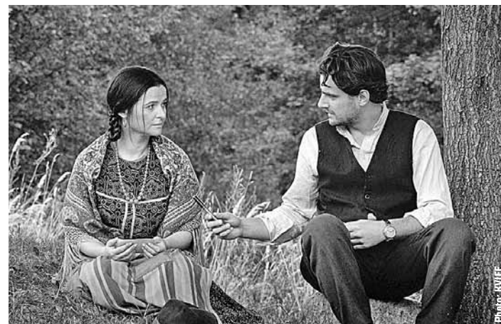
Papusza is shot predominantly in the Romani language.

Before his arrival, Papusza's desire to learn to read and write had raised suspicion among other