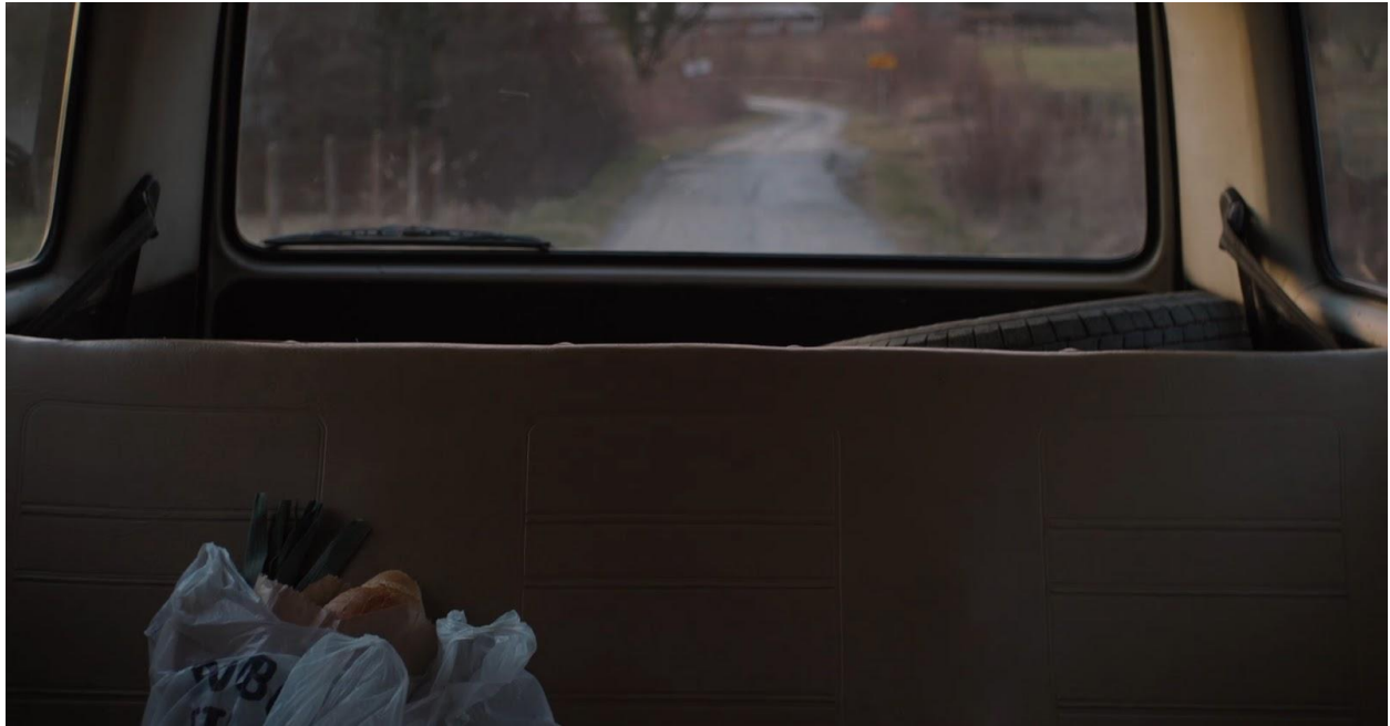
Still from ROOTS

The content of the conversations is based on authentic stories, customs, rituals and culture of people who live in Dvor. Due to its rare practice, conversations about the events and life seem absurd and unreal, thus making passenger's conversations as such as well. The car never stops, on the contrary – it is always on the move and in motion. Focus is on repetition of the travel and rhythmic pauses. Visually, body and space are juxtaposed. People are the ones that are always still while the landscape is in constant movement.