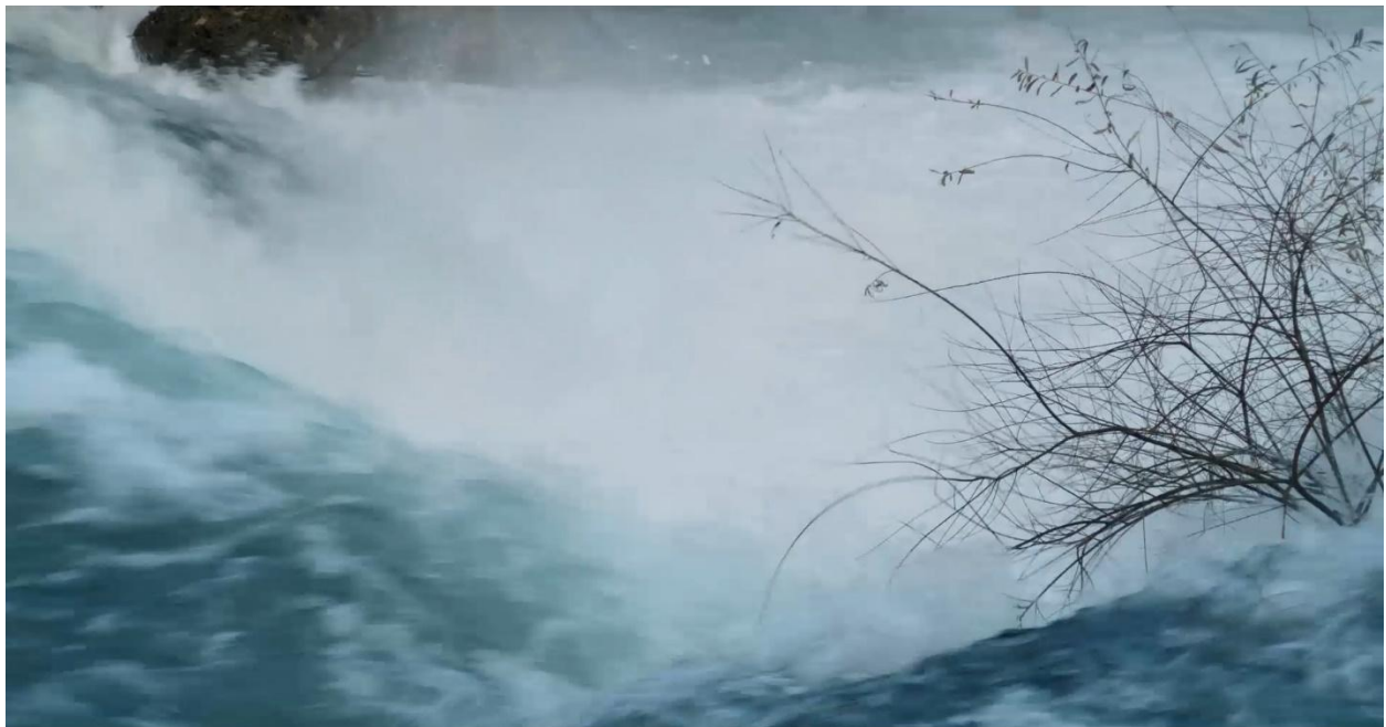
Still from ROOTS