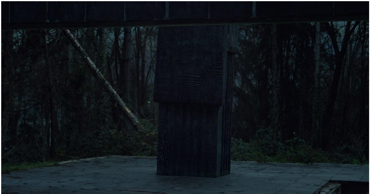
Still from ROOTS

Dvor municipality consists of 64 villages and has around 5 570 inhabitants. After the Ottoman Empire retreated, Austro-Hungarian Empire gave the lands to people willing to keep the bordering area safe from further attacks. Formerly part of Yugoslavia, now Croatia, Dvor is located at the very border with Bosnia, with the river Una as a natural border. Although today the population is majorly of Serbian nationality (71,9%), specific geography and historical currents led to cultural mixing. During the military 'Operation Storm' (1995) most Serbs forcefully left their homes and were scattered around the world. Private history was largely destroyed by the armies passing by, erasing most of the material traces of their former lives. Only a few, mostly elderly, returned after the war ended. Today part of the European Union, Dvor is a perfect example of a 'dying town'. Of prevailing rural character, with little to no content and job opportunities, socially and economically life is more oriented towards the livelier Bosnian city Novi Grad, just across the river. This specific heritage makes Dvor a unique blend of cultures, habits and stories.