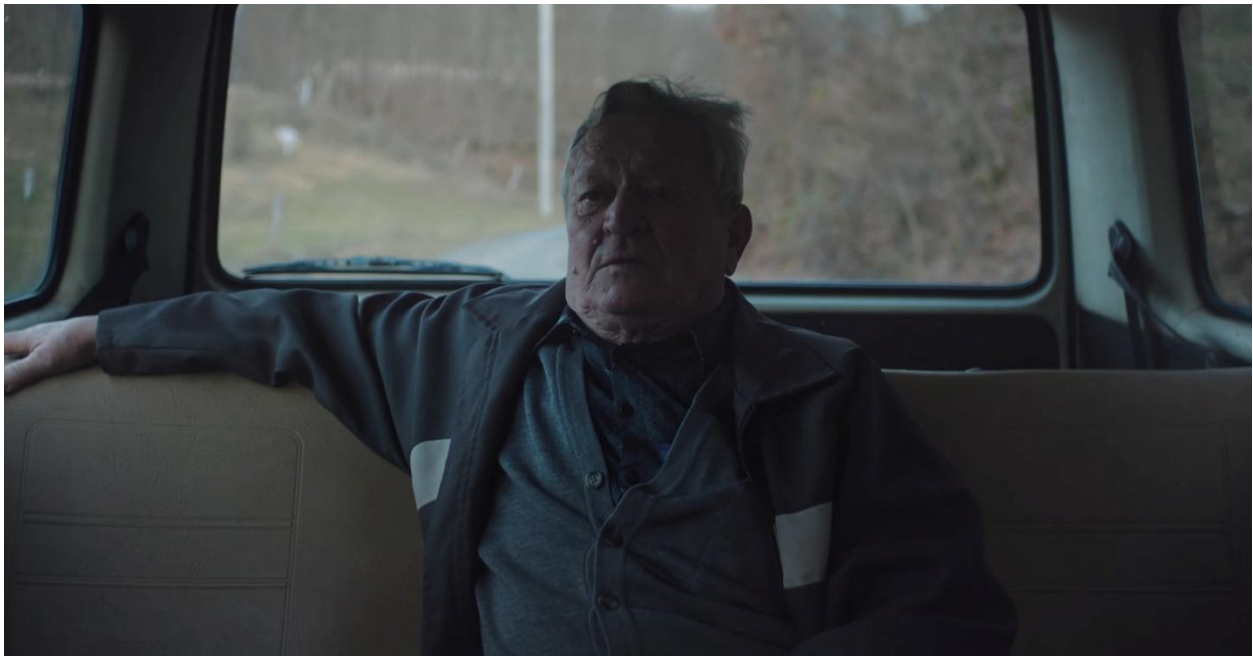
Still from ROOTS – Rade Rakas

ROOTS is made out of long static shots of similar duration, filmed from the inside of a moving car. We see 7 different groups of passengers and stories they carry, arranged symbolically to follow a life span – from childhood to old age and final absence. As our passengers 'grow older', the stories become more serious and lively chit-chats are replaced with worrying about social issues, preserving tradition and reflections on life before finally coming full circle with return to childhood memories.